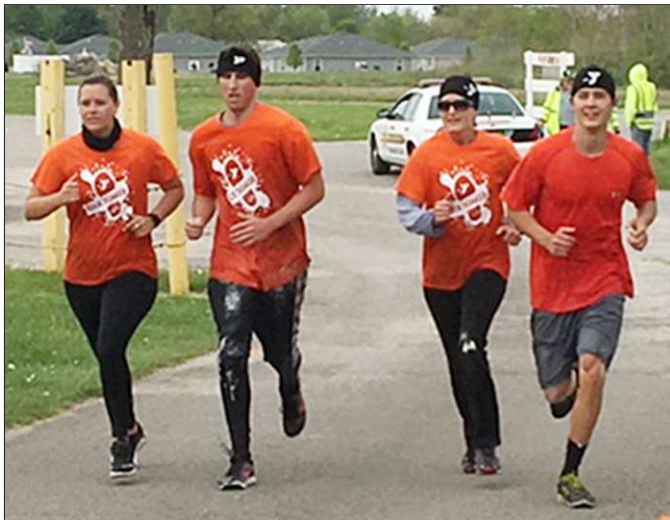
Shown in the photo are runners from previous years' Parkview Huntington Family YMCA Sock Soaker event.