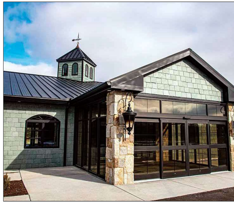
The Clubhouse, Huntington