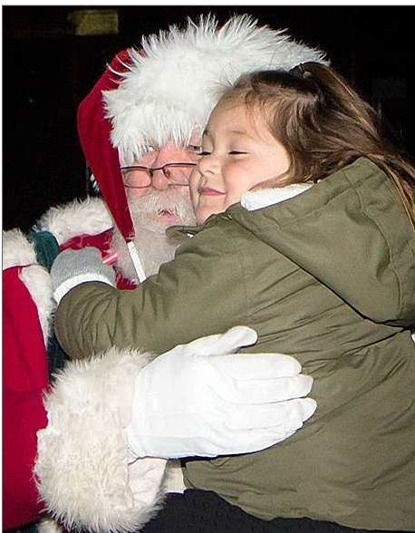
Santa gets a huge hug from one of his admirers at the city Christmas Tree Lighting ceremony at Rotary Centennial Park.