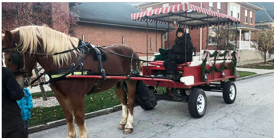
New to Christmas in the City 2022 will be horse drawn wagon rides from Sentimental Journey. The wagon rides are sponsored by Teijin Automotive, Huntington.

Make special Christmas memories and celebrate together as a family in downtown Huntington for Christmas in the City. It promises to be a unique time of joy and celebration for all!