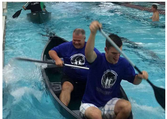
Shown above is a local team battling in the canoe races during the Battle of the Business Competition at the Huntington Family YMCA.