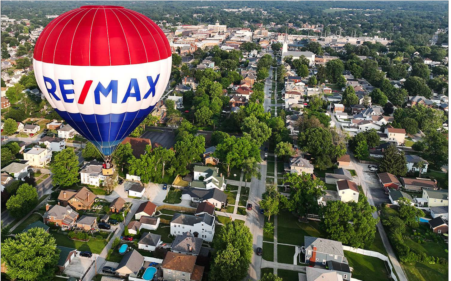
Aerial photo