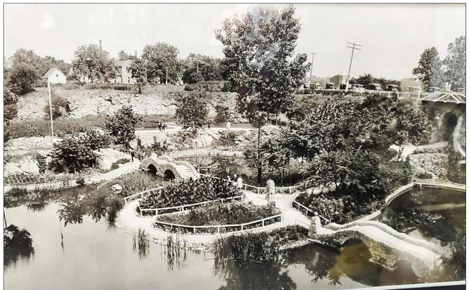
Shown above is a photo of Sunken Gardens taken around 1924. The Chamber of Commerce acquired the old stone quarry, transformed it into Sunken Gardens and then transferred the gardens to the City of Huntington.